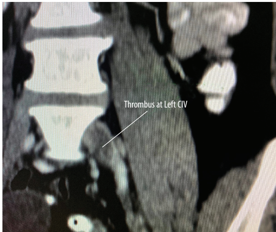
Figure 1: A CT scan showing thrombus in left common iliac vein (CIV).