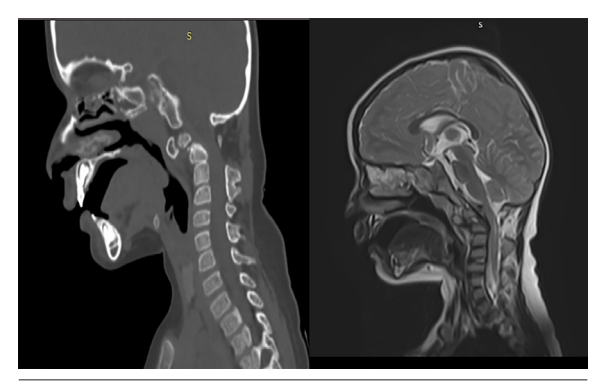
Figure 2: CT and MRI of the cervical spine sagittal section showing displaced complete fracture of odontoid process with posterior impingement at cervico-medullary junction with edema.

of the C2 vertebra, resulting in focal kyphosis and posterior impingement over the craniocervical junction along with significant cord thinning [Figures 1 and 2].