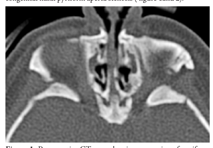
Figure 1: Preoperative CT scan showing narrowing of pyriform aperture.

ears, small chin, high arched palate and the cry was also very weak. The external nasal pyramid and nasal vestibular opening were normal and there was marked decrease in mist formation on spatula test bilaterally suggesting obstruction. There was marked nasal obstruction and it was not possible to pass nasogastric tube through both nostrils for feeding. All the cranial nerves were normal on examination and there was central hypotonia with preserved deep tendon reflexes. There was no coloboma of eye and the cardiovascular examination was normal. There was no ear anomaly. Deafness and throat examination was normal. The neonate underwent complete pituatary hormonal assay which was found to be normal. Other investigations like chest X-ray, ECG, Echocardiogram and Brain CT were also normal. The CT scan of the Nose and paranasal sinuses revealed narrow anterior nasal inlet and bony overgrowth of maxillary nasal process suggestive of congenital nasal pyriform aperta stenosis (figure 1 and 2).