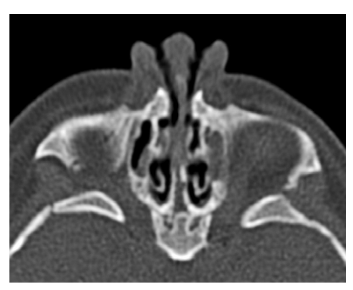
Figure 3: Postoperative CT scan showing patent pyriform aperture.

Surgical management of CNPAS includes dilation and stenting or through a sub labial approach to the premaxilla depending upon the extent of stenosis. In our case, nasal obstruction also was relieved by gradual dilatation by boogies and stenting as the nasal bone in neonatal period is soft and can be dialted. The narrowed nasal aperture can be enlarged by drilling out the nasal process of the maxilla with diamond burrs and dissection instruments. To allow the nasal mucosa to become attached to the new bony margins and to avoid recurrent stenosis nasal, stents are left in place for at least 7 days or longer.