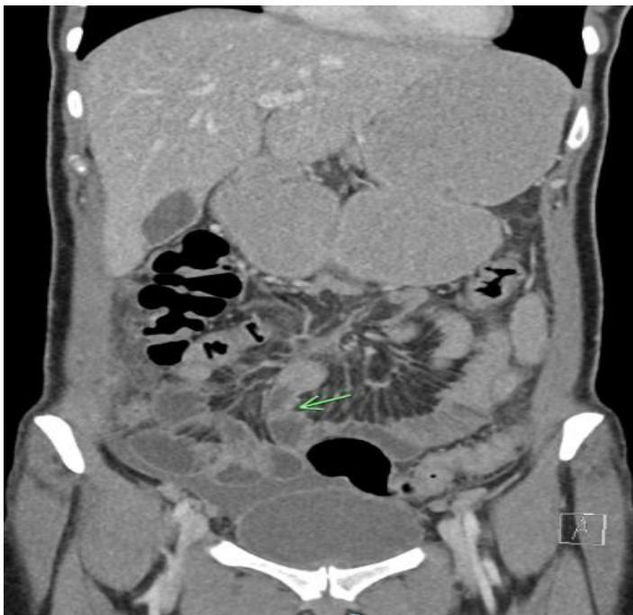
Figure 1c: Coronal view on CT scan showing another transition point