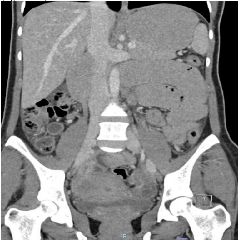
Figure 1a: Coronal view on CT scan showing multiple dilated bowel loops.

Ultrasound abdomen was done, ruled out ovarian torsion, and showed a significant amount of free fluid in the right iliac fossa extending to the Morison pouch and a moderate amount of pelvic free fluid. Computed tomography of the abdomen and pelvis with intravenous contrast was performed and showed distended stomach, duodenum, and proximal jejunal loops with air-fluid level and partial collapse of the distal bowel loops, omental fat stranding, moderate abdominal and pelvic ascites with thickened enhancing peritoneum suggestive of small bowel obstruction (Figure 1 a-d).