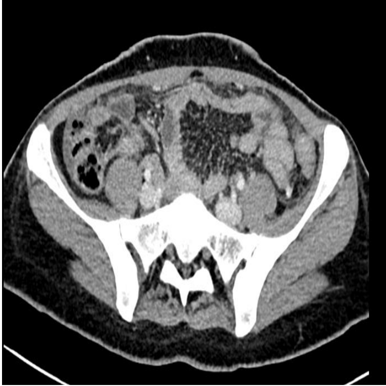
Figure 1d: Axial view on CT scan showing collapsed bowel loops in the pelvis

Given the absence of past abdominal surgical history with the clinical and radiological findings, the patient was consented and taken to the operating theatre for diagnostic laparoscopy after initial resuscitation. Intra-operative findings revealed diffuse soft fibrinous adhesions between the liver and abdominal wall, dilated proximal bowel with collapsed bowel distally, and soft bands causing narrowing of the proximal jejunum (Figure 2a-b). Adhesiolysis was carried out with a harmonic scalpel; the bowel was observed to distend after the release of the bands. Moreover, adhesions above the liver were released. The small bowel was run from the ligament of Treitz to the terminal ileum, and no other pathology was detected.