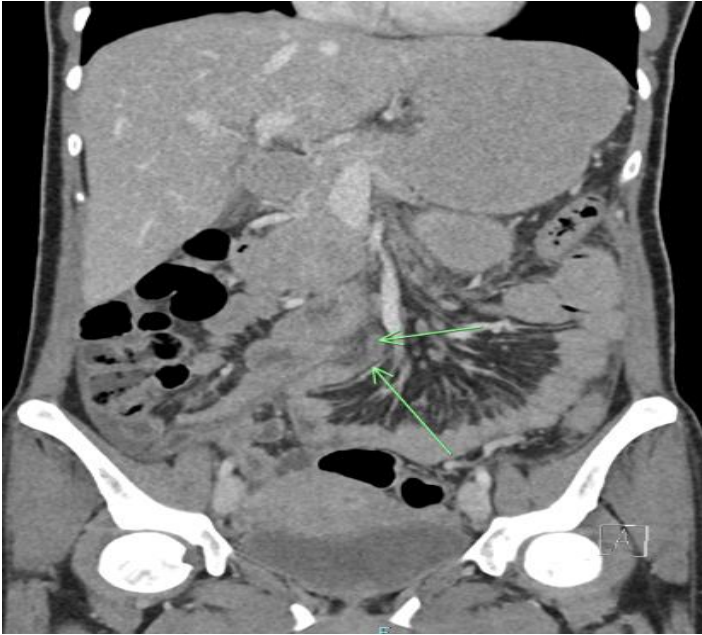
Figure 1b: Coronal view on CT scan showing transition point at proximal small bowel.