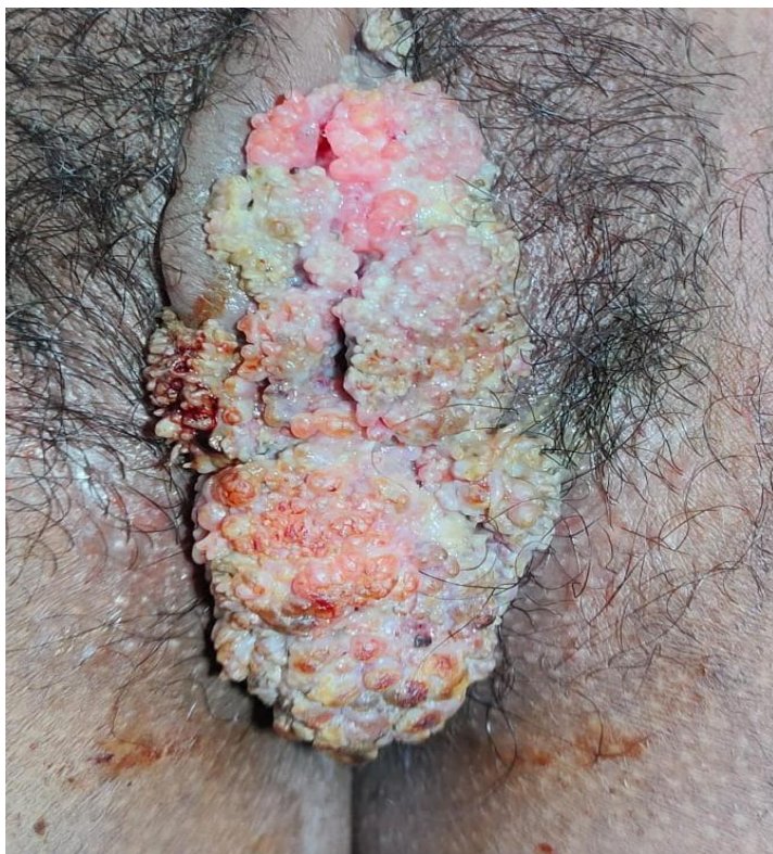
Figure 1: Vulval lesion on admission.

A 21-year-old primigravida at 27 weeks of pregnancy presented with complaints of spotting per vaginum and a vulval mass. She had noticed the growth in the perineal region over the past two months, with an increase in size. The patient reported, good fetal movements and had no significant comorbidities. General and systemic examinations were unremarkable. On abdominal examination, the height of the uterus corresponded to the period of gestation, and fetal parts were palpable. Local examination of the vulva revealed a large cauliflower-like lesion containing multiple raised, skin-colored, fleshy papules measuring a few millimeters [Figure 1]. The lesion involved both labia majora, the lower part of the anterior vaginal wall near the urethral orifice, and the vaginal orifice around the fourchette. The lesion exhibited superficial keratinization and some bleeding points. Secondary infection was noted, with the formation of pus points. No other vaginal or cervical lesions were observed on per speculum examination.