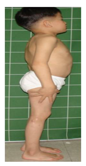
Figure 1: Clinical photograph of the patient presented in OPD showing thoracic kyphosis.

A 6-year-old Korean male presented with progressive kyphoscoliosis and short stature in the outpatient department (Fig. 1). The first child of an unrelated healthy Korean parents, his antenatal diagnosis could not be obtained. At birth, he was 56 cm (>97 centile) and was noted to have severe kyphoscoliosis, relatively short extremities, and narrow chest with elongated face. Radiographic skeletal survey revealed characteristic vertebra plana (dense wafer thin), dumbbell shaped long bones, kyphosis, halberd shaped pelvis, squared calcaneus and coccygeal appendage consistent with the diagnosis of metatropic dysplasia.