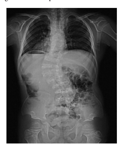
Figure 2: X-ray revealed left sided scoliosis (Cobb's angle 56 degrees) with abnormalities in pelvis and proximal femur metaphysics.

The overall height of the child was 97.5 cm at the age of six years. There was a discrepancy of 4 cm in tibia and 1 cm in femur, with overall limb length discrepancy of 5 cm. The child had a leftsided flexible kyphoscoliosis with Cobb's angle of 56 degrees on standing X-rays (Fig. 2). After careful preoperative pulmonary function evaluation, corrective spine surgery with posterior fusion with pedicle screw instrumentation from T6 to L4 was done after one year (Fig. 3). Bifocal tibial osteotomy and gradual distraction with Ilizarov ring fixator was done later to improve the short stature and limb length discrepancy as calculated by Green-Anderson chart. The ring fixator was kept for 14 months.