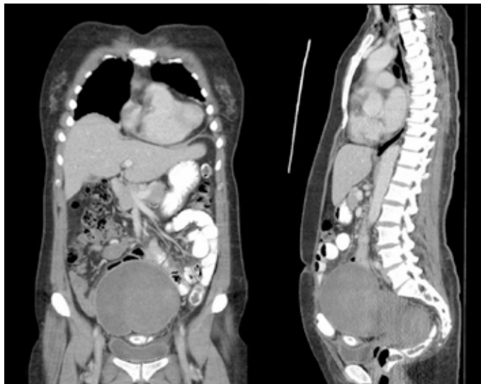
Figures 2A and B: CT of abdomen, pelvis and chest after embolization of inferior mesenteric artery: Lobulated soft tissue density mass seen in the pelvis measuring about 15 \times 6.6 \times 6.5 cm, compressing the rectum and bladder and displacing the small bowel loops laterally.

for her endometriosis nor was she on any hormonal replacement therapy. With this mode of clinical presentation, the differential diagnosis considered were carcinoma of the peritoneum or recto-vaginal septum due to malignant transformation of the remnant endometriosis mainly of clear cell type due to the typical features of pelvic mass, pulmonary embolism and past history of endometriosis.